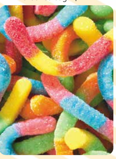
6870 - Sour Gummi Worms Tangy, vivid, and bursting with flavor, these Neon Sour Worms will awaken your taste buds! 9 ounce bag. $14