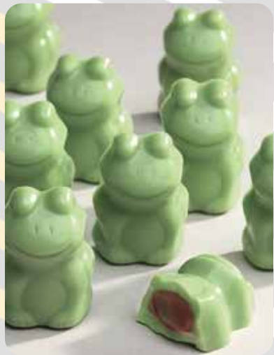
6013 - Frog Fudgies Whimsically sculpted chocolate frogs filled with cool mint fudge. 5.5-ounce box. $14