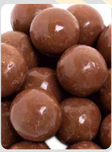
6869 - Malted Milk Balls Delightfully crunchy malted milk balls enrobed in smooth creamy milk chocolate. 7 ounce bag. $14