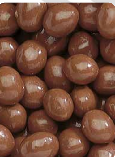
6867 - Chocolate Peanuts Roasted, lightly salted peanuts double dipped in smooth milk chocolate. Gluten free. 7-ounce bag. $14