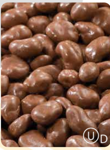
Juicy, sweet raisins covered with a layer of creamy milk chocolate. 7-ounce bag. $14