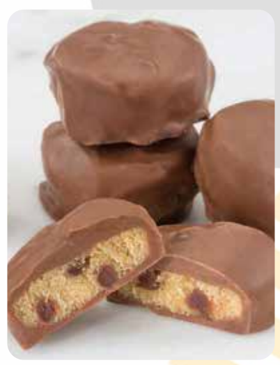
6015 - Cookie Dough Dots Creamy edible chocolate chip cookie dough covered in milk chocolate. 6-ounce box. $14