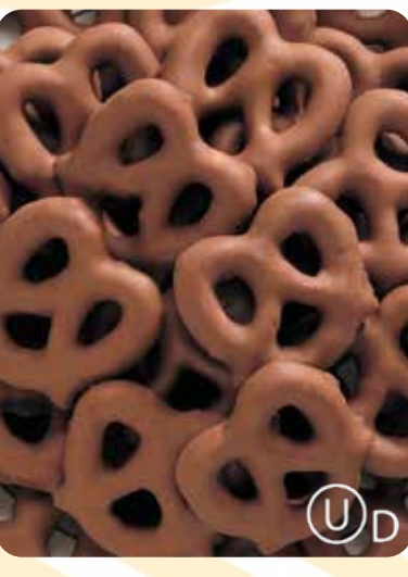
Creamy chocolate Pretzels Creamy chocolate and crunchy pretzels make a delicious combination. 6-ounce bag. $14