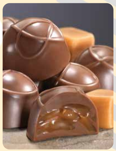
6872 - Dulce de Leche A fresh, milky caramel center surrounded by creamy milk chocolate. Gluten free. 5.5 ounce box. $14