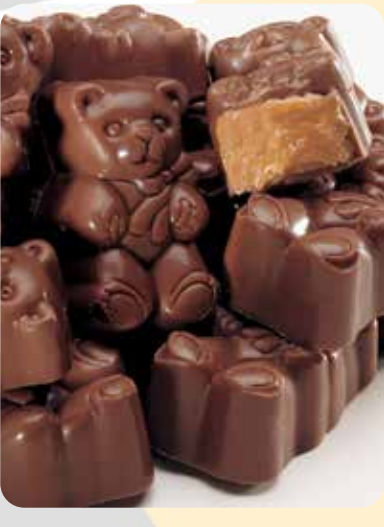
6002 - Peanut Butter Bears Creamy milk chocolate surrounds a smooth, creamy peanut butter center. 6-ounce box. $14