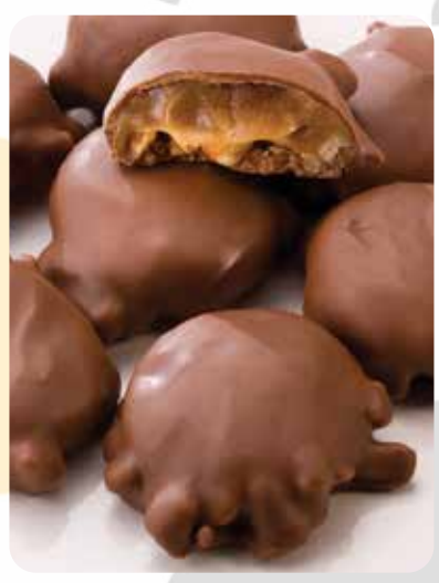
5105 - Pecanbacks ® Pecans covered with fresh caramel then drenched in creamy milk chocolate. 7-ounce box. $16