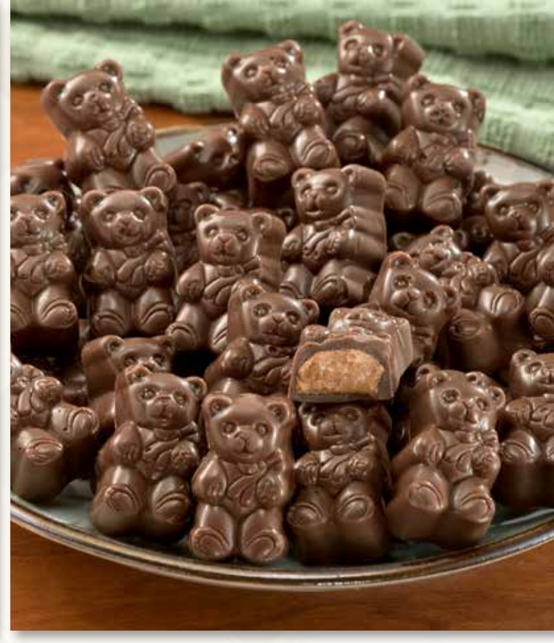
6002 - Peanut Butter Bears Milk chocolate and smooth, creamy peanut butter. 6 ounce box. $14