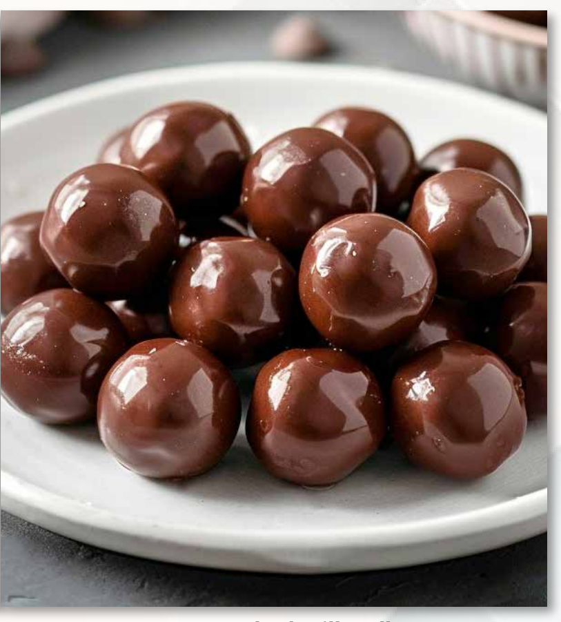
6869 - Malted Milk Balls Milk chocolate covered malted milk balls. 7 ounce bag. $14