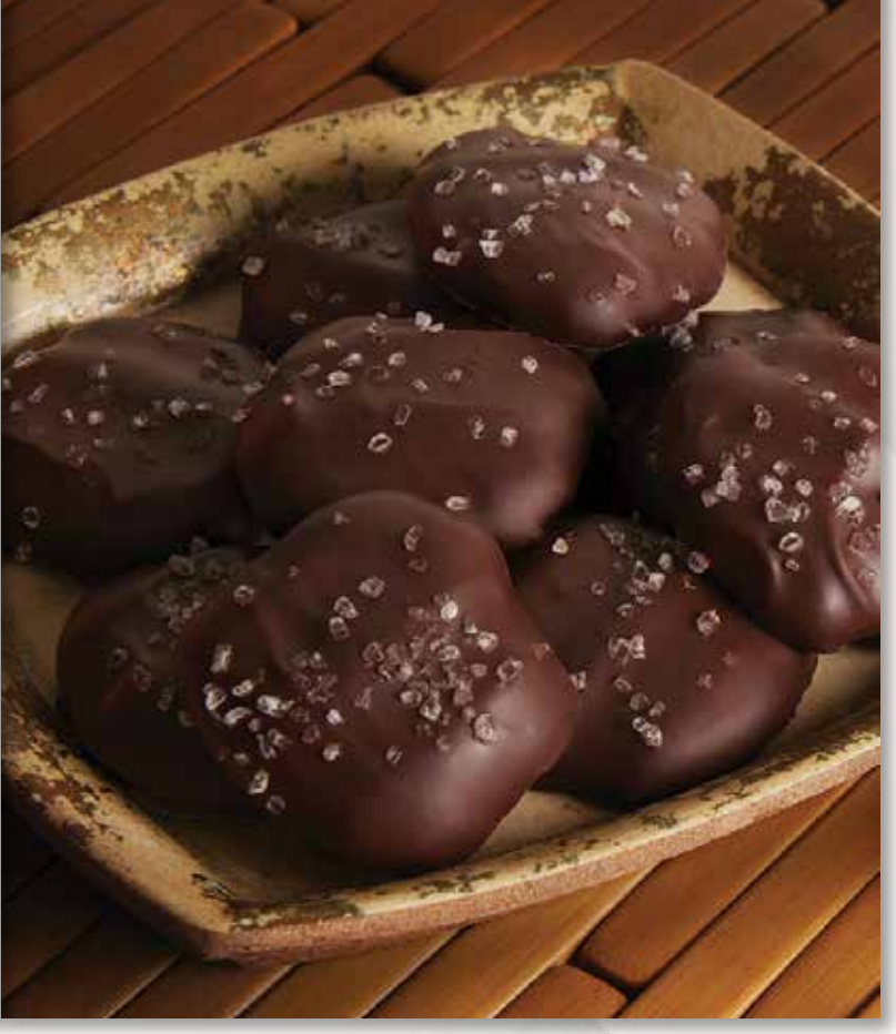
6008 - Dark Chocolate Sea Salt Caramels Chewy caramel surrounded by rich, dark chocolate and sea salt. 6 ounce box. $14