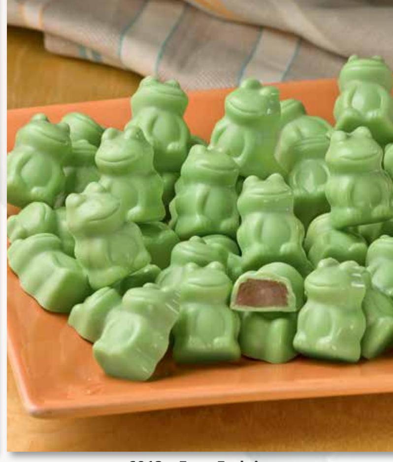
6013 - Frog Fudgies Whimsically sculpted frogs filled with cool mint fudge. 5.5 ounce box. $14