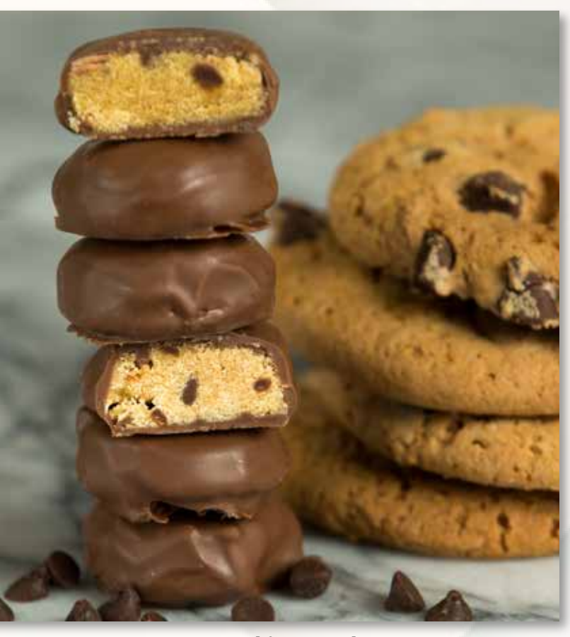
6015 - Cookie Dough Dots Creamy edible chocolate chip cookie dough covered in milk chocolate. 6 ounce box. $14