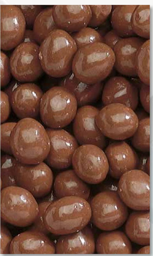
6867 - Chocolate Covered Peanuts Roasted, lightly salted peanuts double dipped in smooth milk chocolate. Gluten free. 7 ounce bag. $14