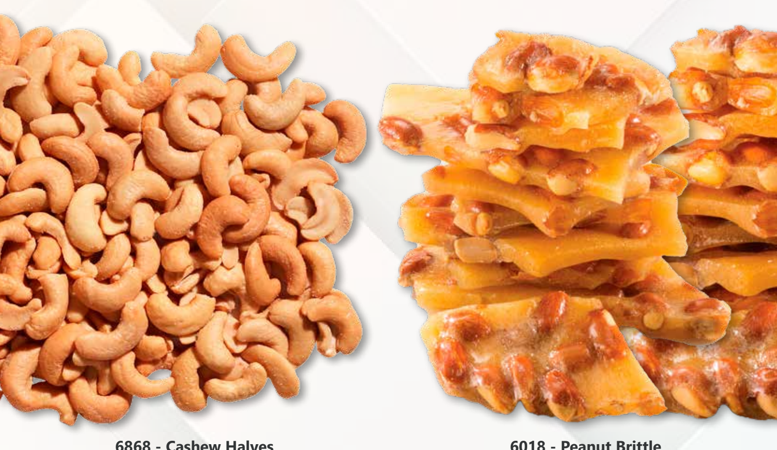
6868 - Cashew Halves

Delicately roasted and lightly salted cashew halves. Perfect for on-the-go snacking, adding to trail mixes, or sharing with friends and family. Gluten-free. 5 ounce bag. $14