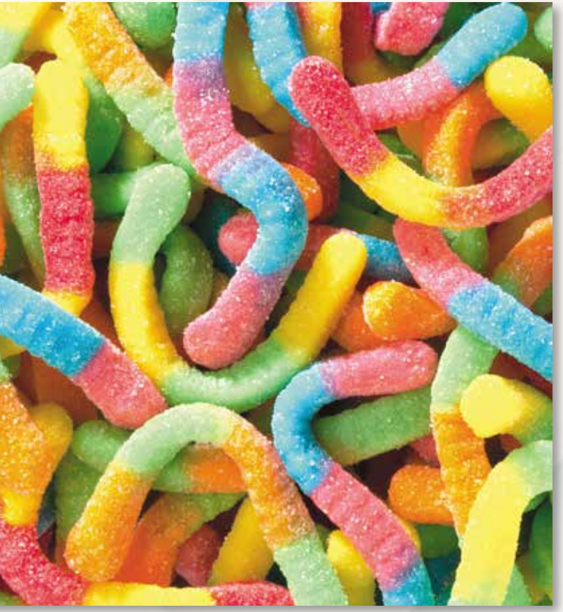
6870 - Neon Sour Gummi Worms

Soft, rich caramel and fancy pecans covered with real milk chocolate. 8 ounce can with resealable lid. $22