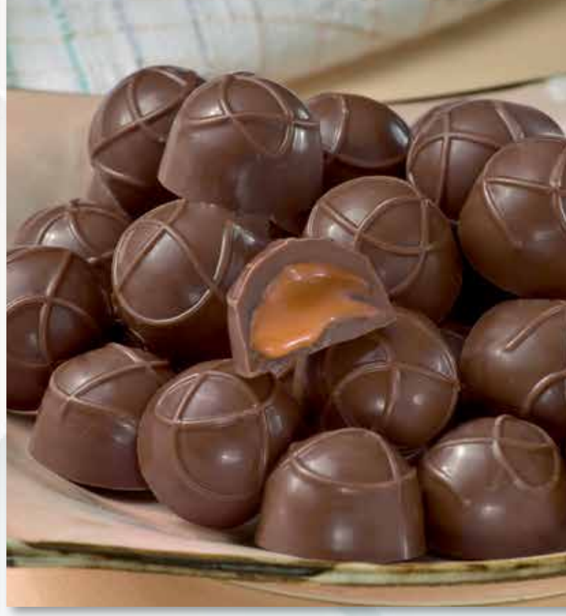
6872 - Dulce de Leche Milk chocolate with a fresh, milky caramel center. Gluten free. 5.5 ounce box. $14