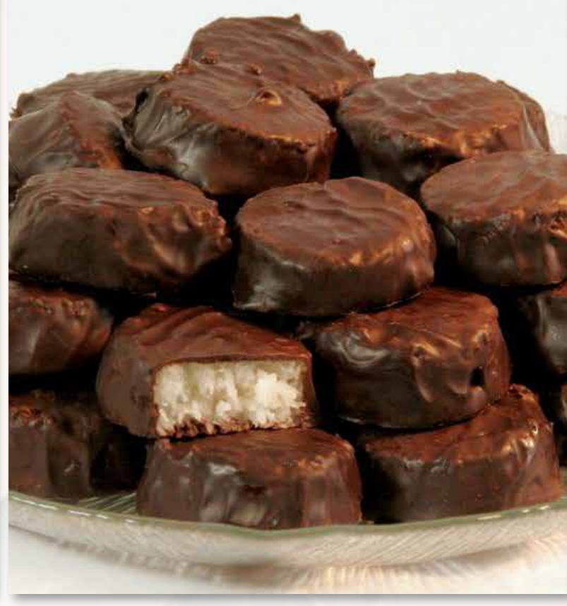
6016 - Dark Chocolate Coconut Dreams The finest coconut from the Philippines combined with smooth dark chocolate. 6 ounce box. $14