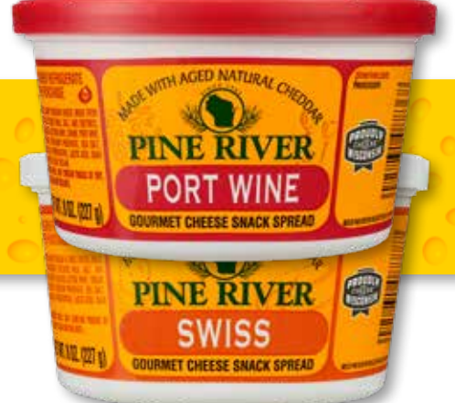
6908 - Swiss A delicious cheddar spread with great Swiss flavor! $13