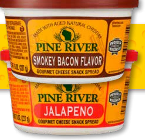
6903 - Jalapeño Creamy cheddar spiced with lively jalapeño and bell peppers. $13