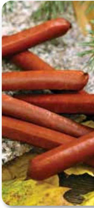
7160 - Teriyaki Ve Venison and pork and tangy teriyaki. Glut