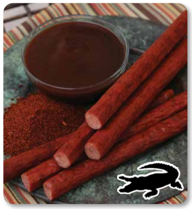
7146 - Cajun Honey BBQ Gator Snack Sticks Gator and pork done up in a special Louisiana-style seasoning. Gluten free. 7 ounces. $20