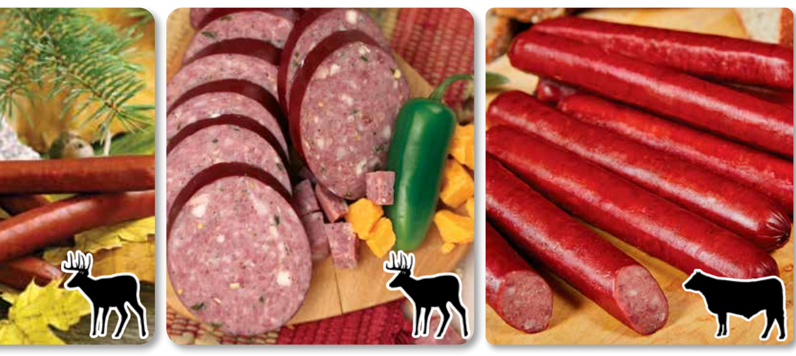
nison Snack Sticks mixed with a sweet