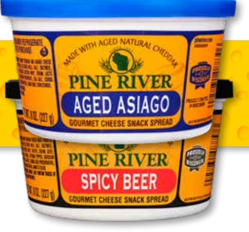
6910 - Spicy Beer A flavorful blend of cheddar, cayenne pepper, garlic, and beer. $13

Mellow aged Asiago cheese spread puts a little Italy on the snack table. $13