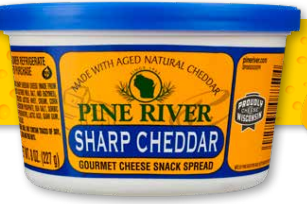
6900 - Sharp Cheddar This buttery sharp cheddar cheese spread is our most popular flavor. $13

Golden cheddar cheese accented with hickory smoked bacon flavor. $13