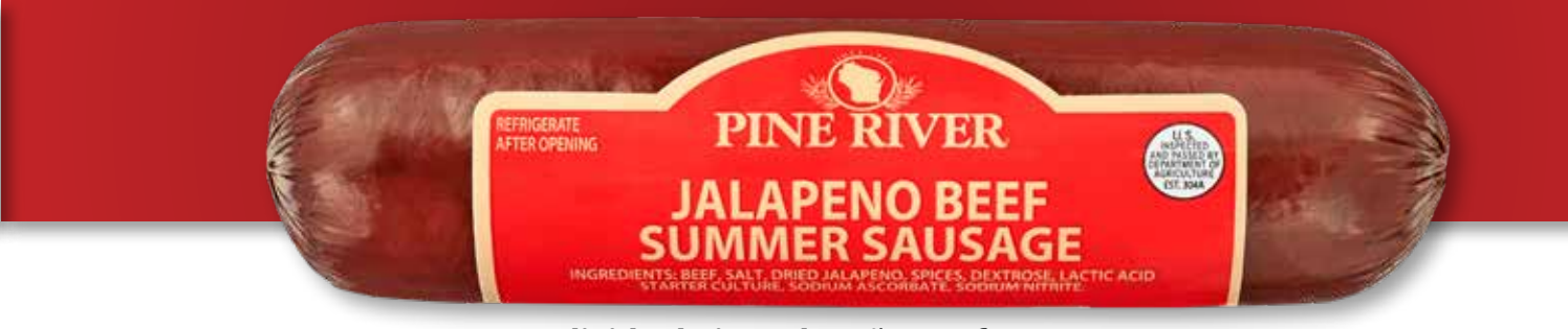
7144 - Individual Size Jalapeño Beef Summer Sausage Black peppercorns and jalapeño peppers add zing to a classic Wisconsin sausage. Gluten free. 5 ounces. $13