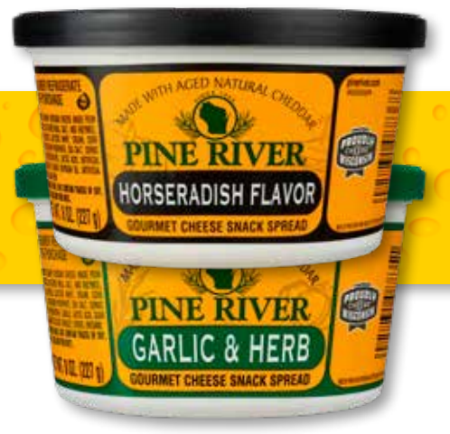
6906 - Garlic & Herb Garlic, parsley, oregano, and chives add flavor to this creamy cheddar. $13

Vibrant white cheddar spread flavored with a touch of zesty horseradish. $13